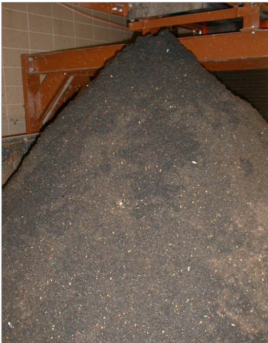
North Shore Sanitary District Clean Grit Output