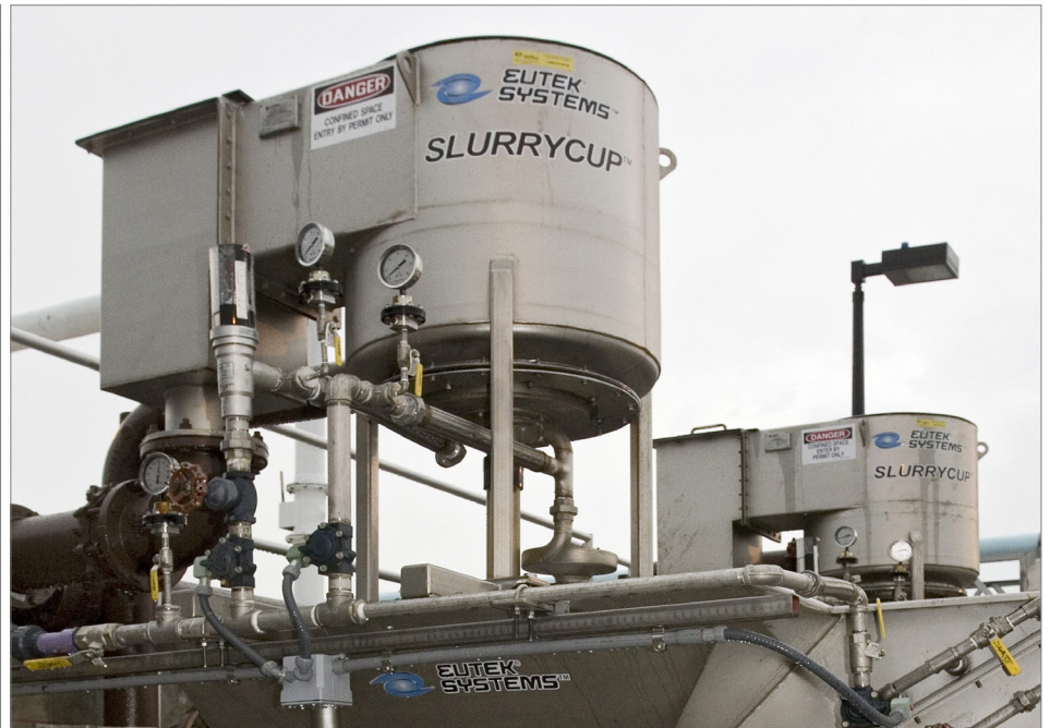
Confidential Plant - Florida