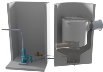
Grit King® Compact Performance in a Flexible Layout

Grit removal solutions designed for the treatment needs, budgets, and space limitations of smaller wastewater treatment plants.