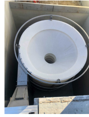
HeadCell® Stacked Tray

Increase potable water treatment efficiency by eliminating sand from water intake with our advanced grit separation systems.