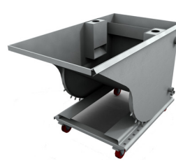
Self Dumping Decanter Batch Grit Dewatering Bin