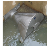
Hydro-Brake® Drop Water Energy Dissipation