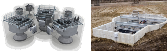
Storm King® Primary Treatment & In-Vessel Disinfection

Our advanced vortex technologies provide cost effective solutions for plants in CSO communities. The Storm King® provides two unit processes in a single device.