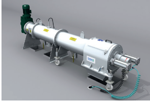
Hydro-Sludge® Screen In-line Sludge Screen

Advanced sludge management processes need protection from grit and debris. We offer robust sludge screening and dewatering solutions to improve sludge quality and process efficiency.