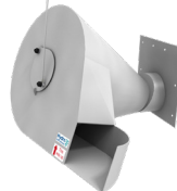
Hydro-Brake® Flow Control Vortex Flow Control

Our flow control solutions help control and alleviate flooding. Our valves reduce storage requirements and our controlled drops are efficient, safe and quiet.