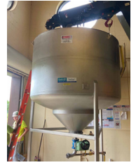
TeaCup® Free Vortex