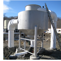
Grit King® Structured Flow