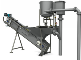
SlurryCup™ / Grit Snail® Sludge Dewatering