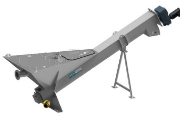
SpiraSnail® Compact Small Footprint Dewatering