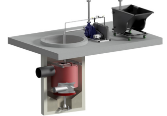
Grit King® Compact with Decanter Dewatering