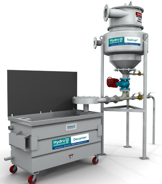
TeaCup® / Decanter with Optional Pressure Cap Design