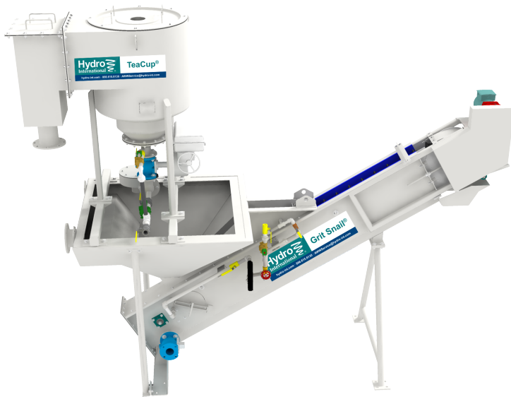
TeaCup® / Grit Snail® with Standard Discharge Box Design