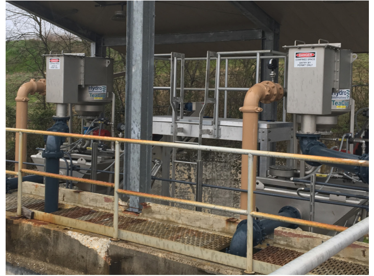
TeaCup® / Grit Snail® Systems with Standard Discharge Box Design