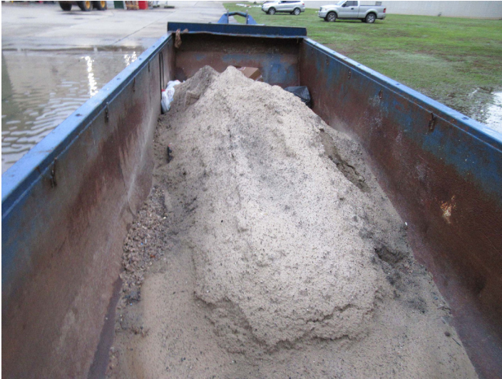
Grit Dumpster Load on May 26, 2020 After Only 0.2" (5 mm) of Rain

After evaluating various technologies, they found their ideal solution in a HeadCell / Hydro GritCleanse system which was started up in April 2020. The Hydro GritCleanse uses a fluidized sand bed which is initially created by seed sand which remains inside the clarifier until sufficient endemic grit has been captured to discharge. For the first month of operation, they had seen very