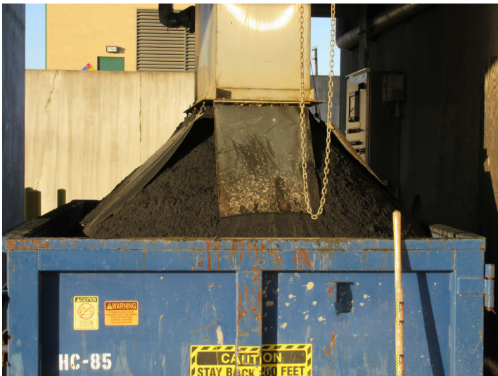
Grit Dumpster Load Midway Through Storm with 3" (7.6 cm) of rain

little grit discharge and were wondering if the system was even capturing grit.