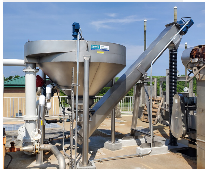
Gills Creek's Installed Hydro GritCleanse™ System