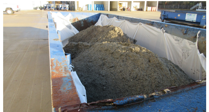
Grit Dumpster After New Year's Weekend Rain Event at the Beginning of 2021

During these rain events, the city saw first-hand how well their new HeadCell / Hydro GritCleanse was protecting them. With such heavy rains, flooding was happening across the state. During these severe storms, area residents had plenty to worry about, but their critical wastewater infrastructure needs was not one of them. During the heaviest parts of the rains their new HeadCell and Hydro GritCleanse system from Hydro International was filling dumpsters with low organic grit ready for landfill, depositing between 25 and 30 tons (23 - 27 t) of grit per event into their dumpsters rather than throughout the treatment plant.