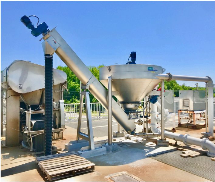
Operating Hydro GritCleanse™ System