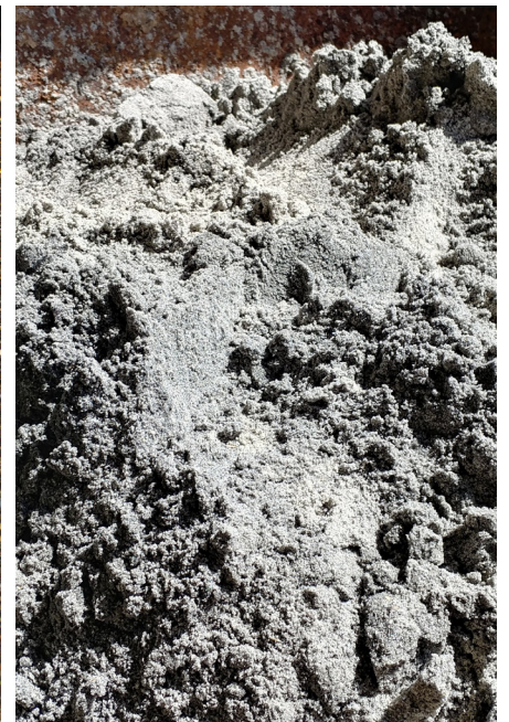
Hydro GritCleanse™ Output <5% VS