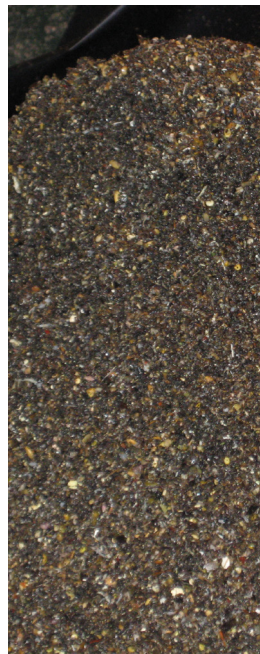
Conventional Grit Washer Output >50% VS