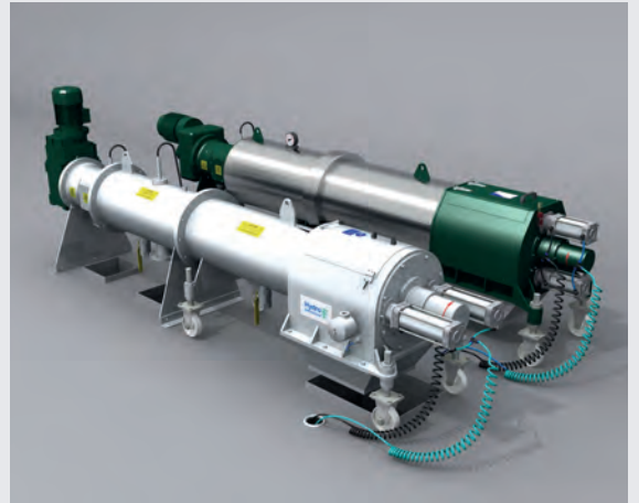
Fig.1 Hydro-Sludge™ Screen - stainless steel option (front) and cast iron with stainless components option (back).