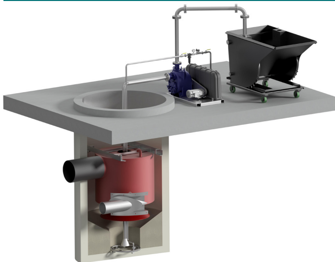
Grit King® Compact with Self-Dumping Decanter Dewatering Option

The Grit King® Compact arrives on-site already configured to fit your tank's dimensions. The system just needs the grout poured for the grit sump. This allows you to rapidly get the system up and running with minimal installation time and costs.