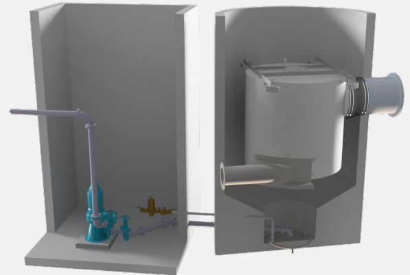
Installed Grit King ® Compact System [right]